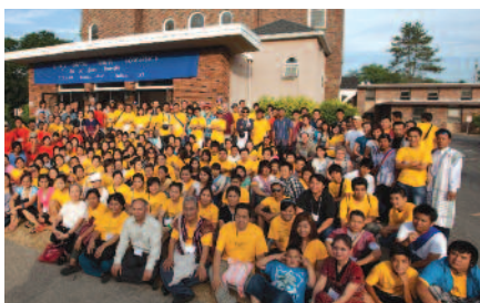
The 2011 Karen Baptist Youth Conference

With its “Be a Good Example” theme from I Timothy 4:11-12, the conference sought to foster Karen youth’s